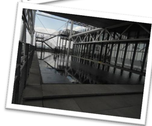
Pictures from Top: Sketching in Pierrefonds, Monet's Garden, The Pompidou Centre and Left: Dinner out in Paris.